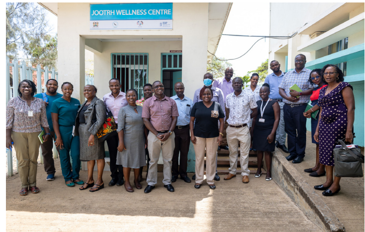
NASCOP team together with CDC Western Kenya team, JOOTRH staff and ENTRENCH Kisumu team during a recent visit to Jaramogi Oginga Odinga Teaching and Referral Hospital