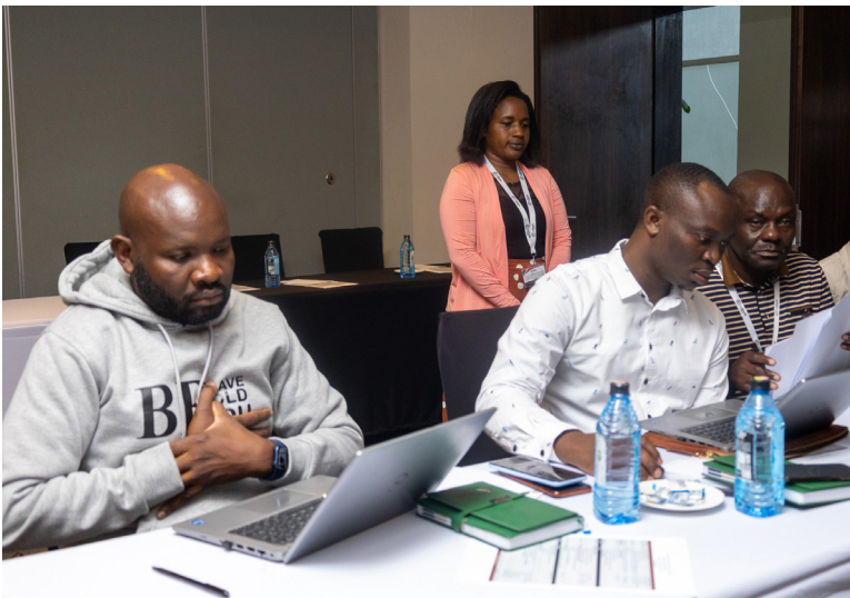
CIHEB-Kenya participates in KP implementing partners meeting held in Kisumu in January 2023.