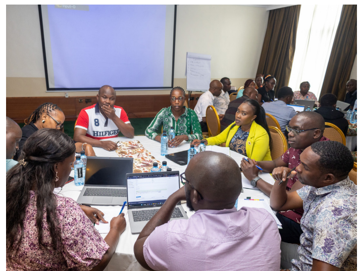
Finance and Administration Team Planning team during a breakout session to discuss Enterprise Resource Planning (ERP) implementation per department