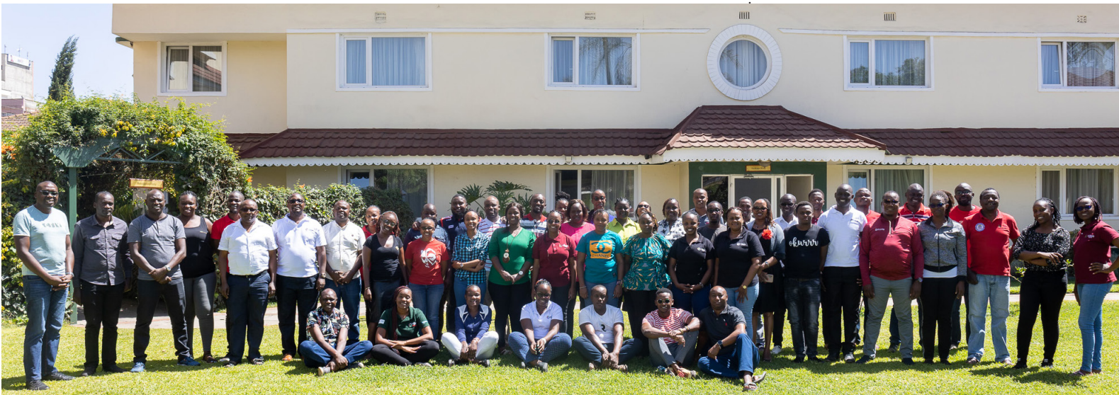
Finance and Administration team Planning Meeting

CIHEB-Kenya's, PACT Imara program supports the provision of comprehensive HIV and TB prevention and treatment services for general in 80 facilities and for key and priority populations in 3 drop in clinics and through community outreaches, in Kitui County