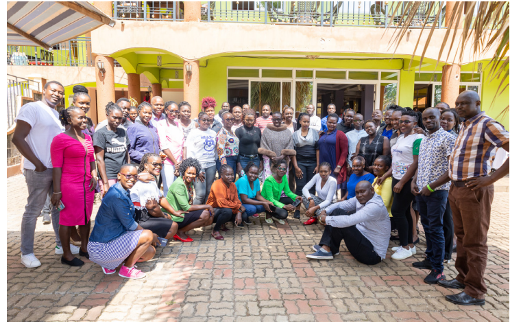
Migori County DREAMS cross-learning meeting among CIHEB-Kenya staff working across the supported dream sites in the County.