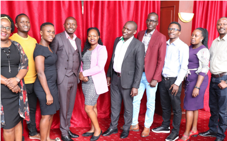
CONNECT Program meeting to discuss expanding the DREAMS project's geographic reach to new wards to decrease HIV infections among adolescent girls and young women (AGYW) (10–24 years) in Nairobi's informal settlements.