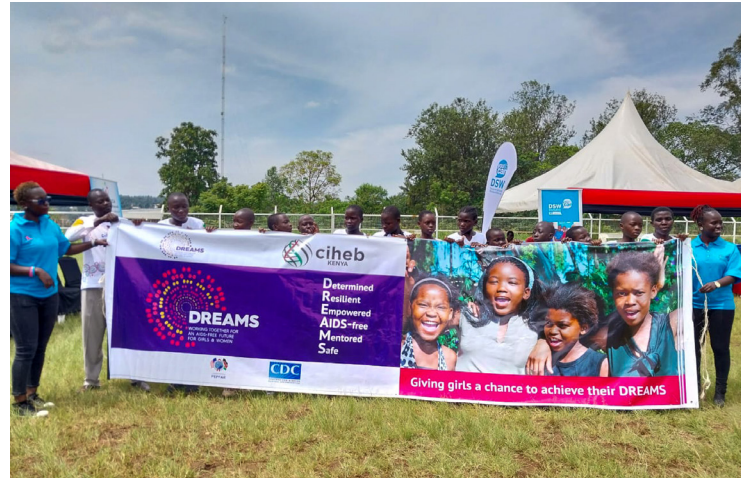
The ENTRENCH team in Migori commemorates the World AIDS day by considering how #Equalize can support the Adolescent Girls and Young Women.