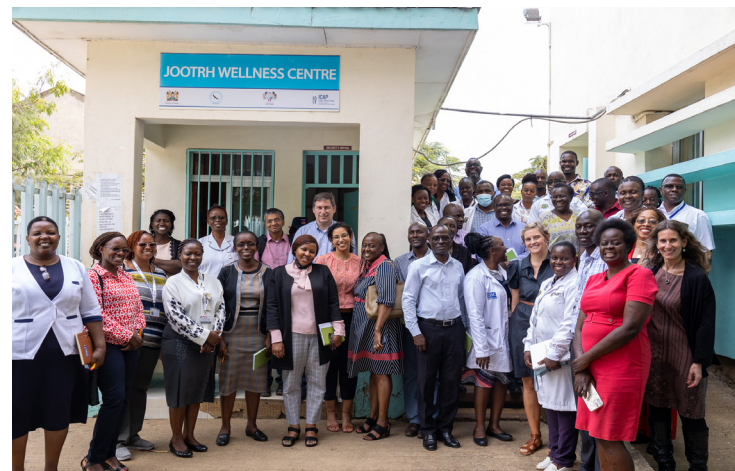
OGAC team together with CDC Western Kenya team, JOOTRH staff and ENTRENCH Kisumu team during a recent visit to Jaramogi Oginga Odinga Teaching and Referral Hospital