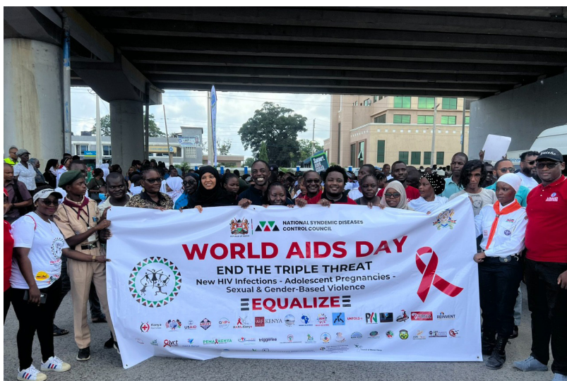
Team Stawisha Pwani commemorates the World AIDS day in Mombasa county during this years celebration aimed at reducing inequalities towards combating the HIV/AIDS disease.