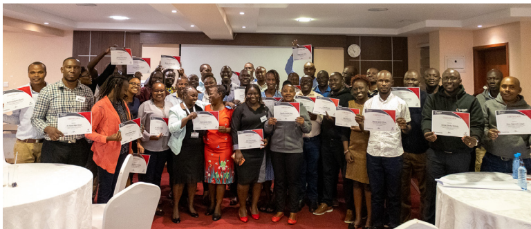
CIHEB-Kenya and UMB Kenya leaders graduate from a Manager essentials program dubbed the 7 Habits for Managers.