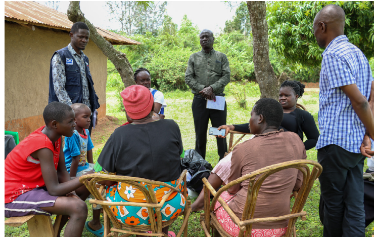
TRACK Bondo Sub-county round two COVID-19 vaccination targeting clients who received their first doses during the households enumeration exercise conducted earlier in July/August 2022.