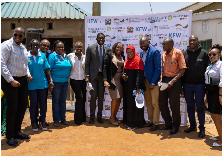
CIHEB CONNECT team during the commissioning of water desalination plant at Kibera Level IV Hospital in Nairobi County.