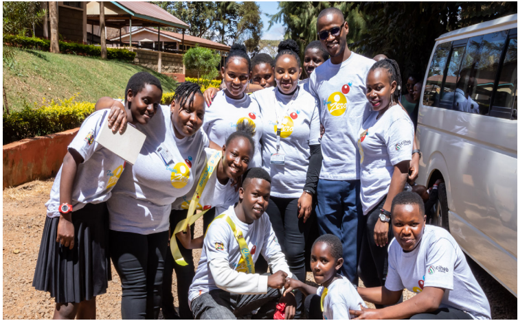
PACT Imara team during OTZ south-south cross learning at Kangundo County Hospital