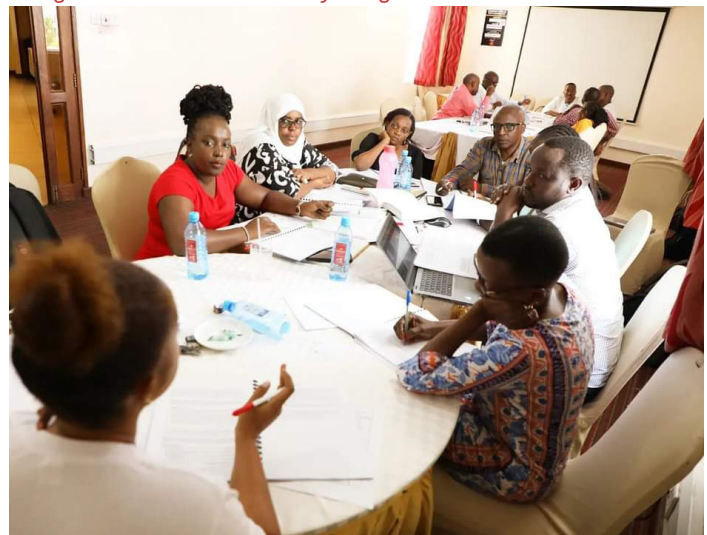
CIHEB Stawisha Pwani during the revision of ART Guidelines in Mombasa County.