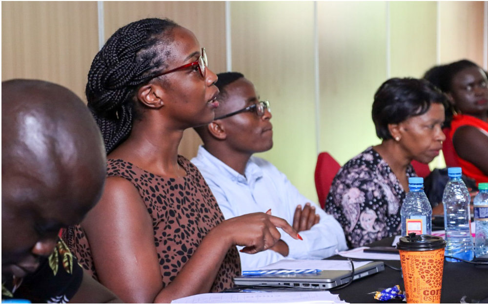
TRACK team during the Community Health Assistants training in Alego Usonga

TRACK team concluded the five-day household enumeration exercise in Alego Usonga Sub-county, Siaya County on September 23, 2022.